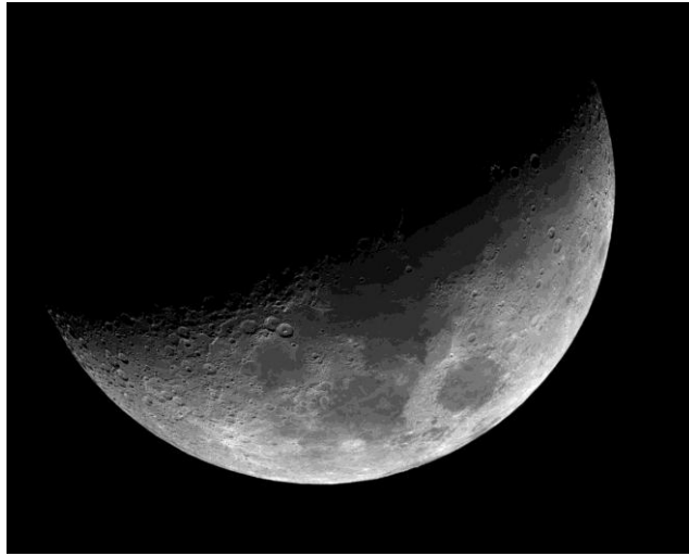
The crescent Moon as it appears in binoculars. The dark areas are the “maria” or seas; the cratered lighter areas are the lunar highlands.

they are bone-dry and covered with fine dust. The maria were flooded with lava after the solar system had been mostly cleared out of stray material that smashed into the Moon's surface. That's why these younger regions are smoother and have far fewer impact craters.