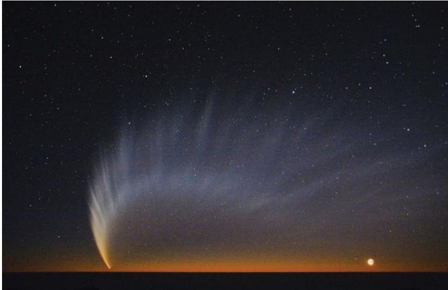
The dusty tail of Comet McNaught in 2007

As seen from Earth, comets are far less common than meteors. There might be a half-dozen comets visible each year, though they are usually faint enough to require a telescope to see well. Every 10 years, on average, a comet grows bright enough to become easily visible with the naked eye. Comet Hale-Bopp in 1997, and Comet McNaught in 2007 were examples.