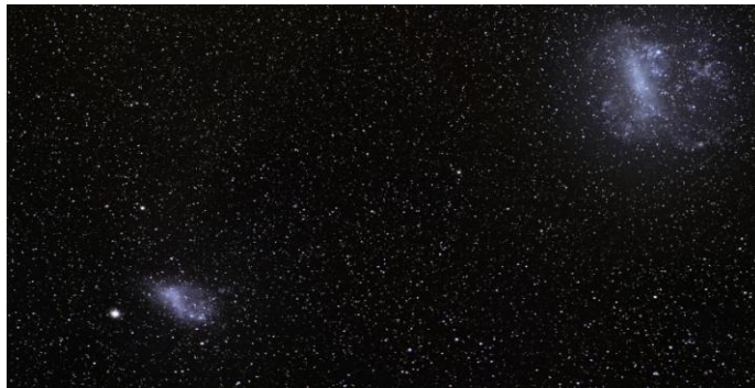
The Magellanic Clouds, two nearby irregular galaxies visible only from the southern hemisphere

Elliptical galaxies have a much wider range of mass and size, and have a much less complex structure than spiral galaxies. A dwarf elliptical might have a few million stars, not much bigger than a globular cluster. A giant elliptical like M87 might have a trillion stars. Elliptical galaxies may have formed by gobbling up smaller elliptical and spiral galaxies after repeated gravitational encounters over billions of years. Because they lack the gas and dust of a spiral galaxy, elliptical galaxies don't have much new-star formation going on.