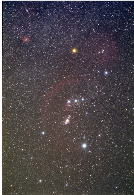
The red-orange star Betelgeuse (upper middle) contrasts with the blue-white stars of the constellation Orion

These color differences are real. Just as hot coals in a fire will glow red, and hotter coals will glow white, the color of a star depends on its temperature. Red stars are coolest. They have a temperature of 4,000-5,000 Kelvin at their surface. Yellow-white stars like our Sun are hotter... about 6,000-10,000 K. And blue stars are the hottest of all, with surface temperatures of 15,000 to 30,000 K.