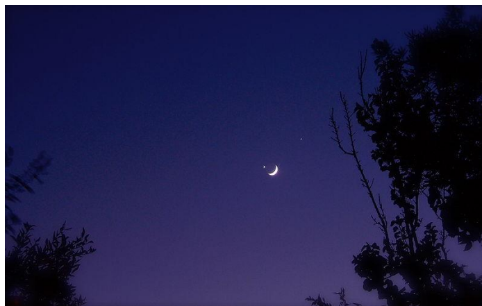
The Moon and Venus after sunset

http://oneminuteastronomer.com/sky-this-month/