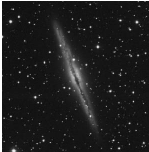
Edge-on spiral galaxy NGC 891 in the constellation Andromeda

Seen from edge-on, a spiral galaxy reveals the dust lanes of its spiral arms and the bulge of its nucleus, which contains older yellow-red stars left over from the early days of the galaxy's formation. The image of the galaxy NGC 891 below shows what the Milky Way might look like from the side. In fact, our Milky Way looks much like this in wide-angle photographs, since we see our galaxy edge-on from a point out near its edge, about 25,000 light years from the center.