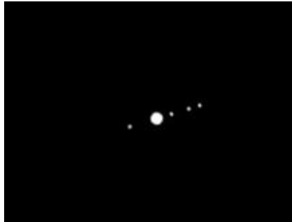
Jupiter and its 4 largest moons in binoculars

accomplishment for a beginner to see these distant and icy giants at all. Pluto is too faint to see in all but the largest backyard telescopes.