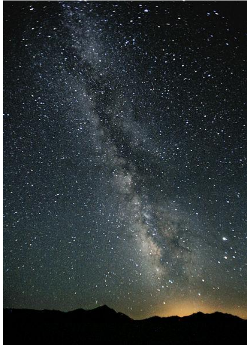
Stars along the plane of the Milky Way Galaxy

Take a look at the stars on the next clear night. Aside from differences in brightness from star to star, you will also see differences in color. Some stars, like Rigel in the constellation Orion, are blue. Others, like Altair in Aquila, are white. Arcturus, a bright star in the northern spring sky, is yellow-orange. Yet others, like Betelgeuse in Orion or Antares in Scorpius are a deeper orange-red.