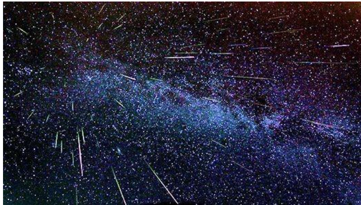
Meteors from the Perseid meteor shower

Most meteors burn up before they hit the ground. The fainter meteors are the size of sand grains. Brighter ones range from the size of a pea to a golf ball, and very bright meteors might be the size of a softball. Very rarely, large meteors, perhaps the size of a basketball or a little larger, and especially if they are made of iron and nickel, will burn through the atmosphere and hit the ground, or explode before they hit the ground. When it hits the ground, it's called a meteorite .