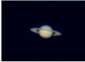
Saturn as it appears in a small telescope

With your unaided eye, you can see Mercury, Venus, Mars, Jupiter, and Saturn. If you know just where to look, you might see Uranus too. Binoculars are not powerful enough to reveal much detail on the face of any planet, though they will reveal the four largest moons of Jupiter that move like clockwork around the planet from hour to hour and night to night (see image below). Saturn's largest moon, Titan, is also visible in binoculars and any telescope. But to see any detail of the face of the planets, or to see the phases of Mercury and Venus, you will need a telescope.