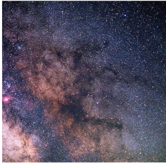
Dark Nebula in the foreground of stars along the Milky Way

Because dark nebulae are the birthplace of stars and planets, astronomers find them intensely interesting. Computer modeling shows that although the nebulae are tenuous, with only a few particles per cubic centimeter, passing stars push and pull on the particles, causing them to coalesce into denser patches that begin to fall in on themselves and heat up. Hundreds of tiny globules in a dark nebula may eventually become hot enough to start the process of nuclear fusion, where hydrogen in the center of the globule begins to burn into helium, releasing huge amounts of energy. When this happens, dense globules of gas and dust turn into clusters of new stars which light up the remaining dust and gas into what astronomers call diffuse nebulae .