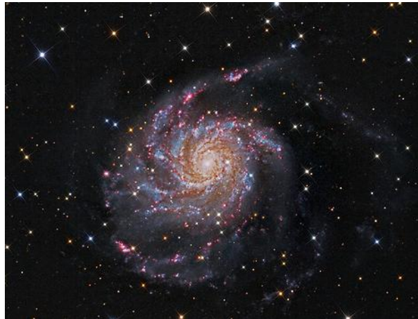
Face-on spiral galaxy Messier 101

Small telescopes don't show the most distant galaxies, but hundreds of nearby galaxies lie within reach of a 3" or 4" scope. A dozen or so can be seen with binoculars. Though galaxies tend to be dim in small optics, a practiced eye can still detect a surprising amount of detail if the sky is dark and free of light pollution.