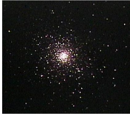
The globular cluster M5 as it might appear in a small telescope

You can see dozens of these spherical, tightly-bound clusters with binoculars or a small telescope. In the northern hemisphere, the brightest and prettiest globular clusters include the Great Cluster in Hercules, also known as M13, and the clusters M3 and M5 in the constellations Canes Venatici and Serpens, respectively. The two brightest globular clusters in the sky, the Omega Centauri cluster and 47 Tucanae (in Centaurus and Tucana, respectively) are only visible south of the tropics.