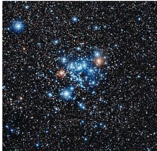
An open star cluster

After the hot stars near the center of an emission nebula push away the remaining gas and dust, a group of a few dozen to a few hundred young stars remain clustered together. These groups are called open star clusters . They are beautiful to observe, especially in dark sky where they look like dazzling jewels set against the black velvet of deep space.