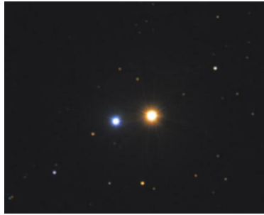
The double-star Albireo in the constellation Cygnus as it appears in a telescope

Some stars look bright because, well, they ARE bright. Others appear bright because they are close to us. Deneb, the brightest star in Cygnus, is one of the brightest stars known... about 60,000x brighter than our Sun. Deneb is 1,500 light years away (one light year is the distance light travels in one year, about 9.5 trillion kilometers). The star Sirius, on the other hand, appears even brighter than Cygnus (in fact Sirius is the brightest star in the sky as seen from Earth). But it's only 25x brighter than our Sun and only 0.0004x as bright as Deneb. Sirius only appears brighter than Deneb because it's 175 times closer... just 8.6 light years away.